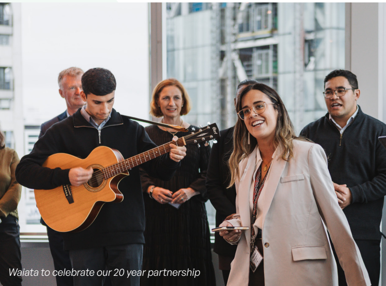
Waiata to celebrate our 20 year partnership